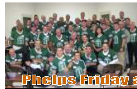
Phelps Friday and Saturday Teams