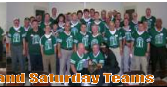
LPCG Work Release